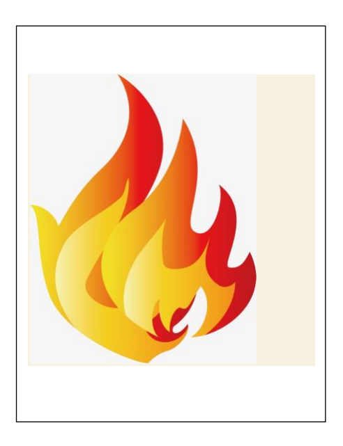
Pentacost Sunday June 5, 2022