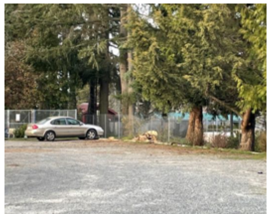
Five truckloads later