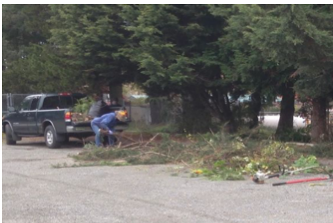
Clearing the brush