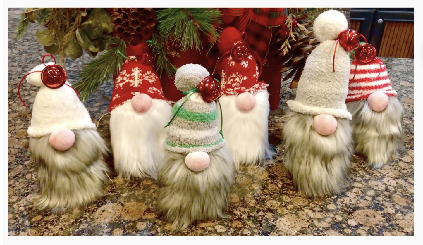
How to make cute Christmas Gnomes in 15min!!!

Come to the Holiday Bazaar! There will be soaps, holiday cookies, lemon curd, needlepoint tree ornaments, custom bows for Christmas wrapping, mini holiday breads, fresh swags of local evergreens, our signature little gnomes, Christmas and advent candles and much more.