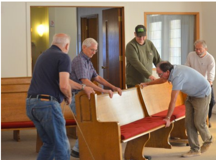
We needed lots of helpers to put the pews back in the sanctuary

When you arrive for worship Sunday September 2 nd , you'll find a new look to the sanctuary. The new carpet is installed and the pews were put back in their places. There will be a rededication service Sunday, September 23. There were a few delays so the sanctuary just got put back together Saturday the 1st!