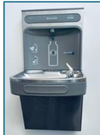
Our new water fountain and filing station